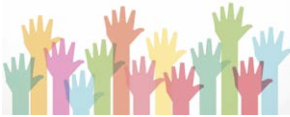
Voters' Meeting today, July 7, 2024 | 10 30 a

July 7, 2024 The 7 th Sunday after Pentecost 9a Service of Holy Communion 10 15 a Snacks 10 30 a Voters' Meeting