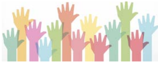
Voters' Meeting Sunday, today 7, 2026 | 10 30 a

June 7, 2026 The Second Sunday after Pentecost 9a Service of Holy Communion 10 15 a Snacks 10 30 a Voters' Meeting